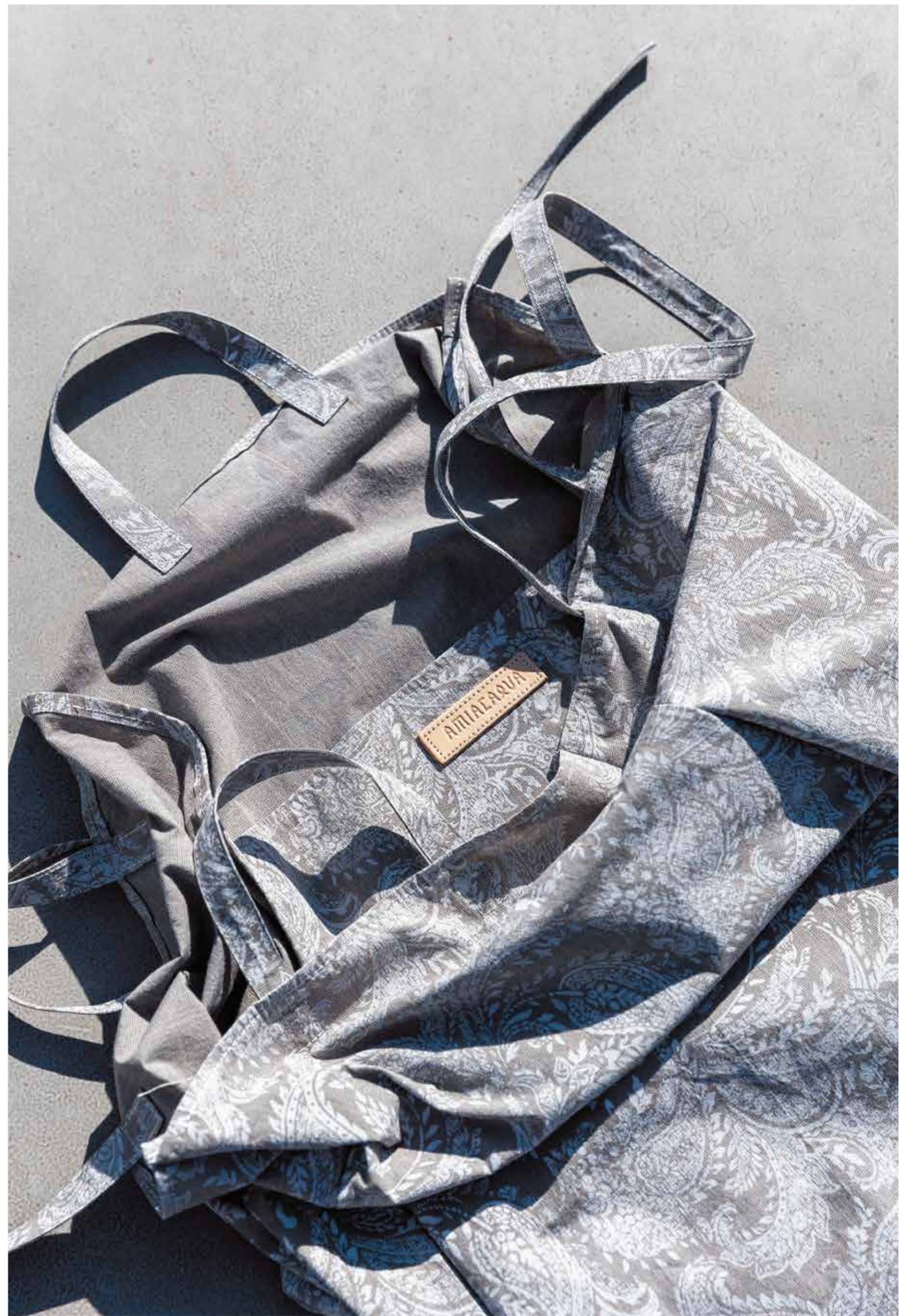
FALL/WINTER COLLECTION 2024