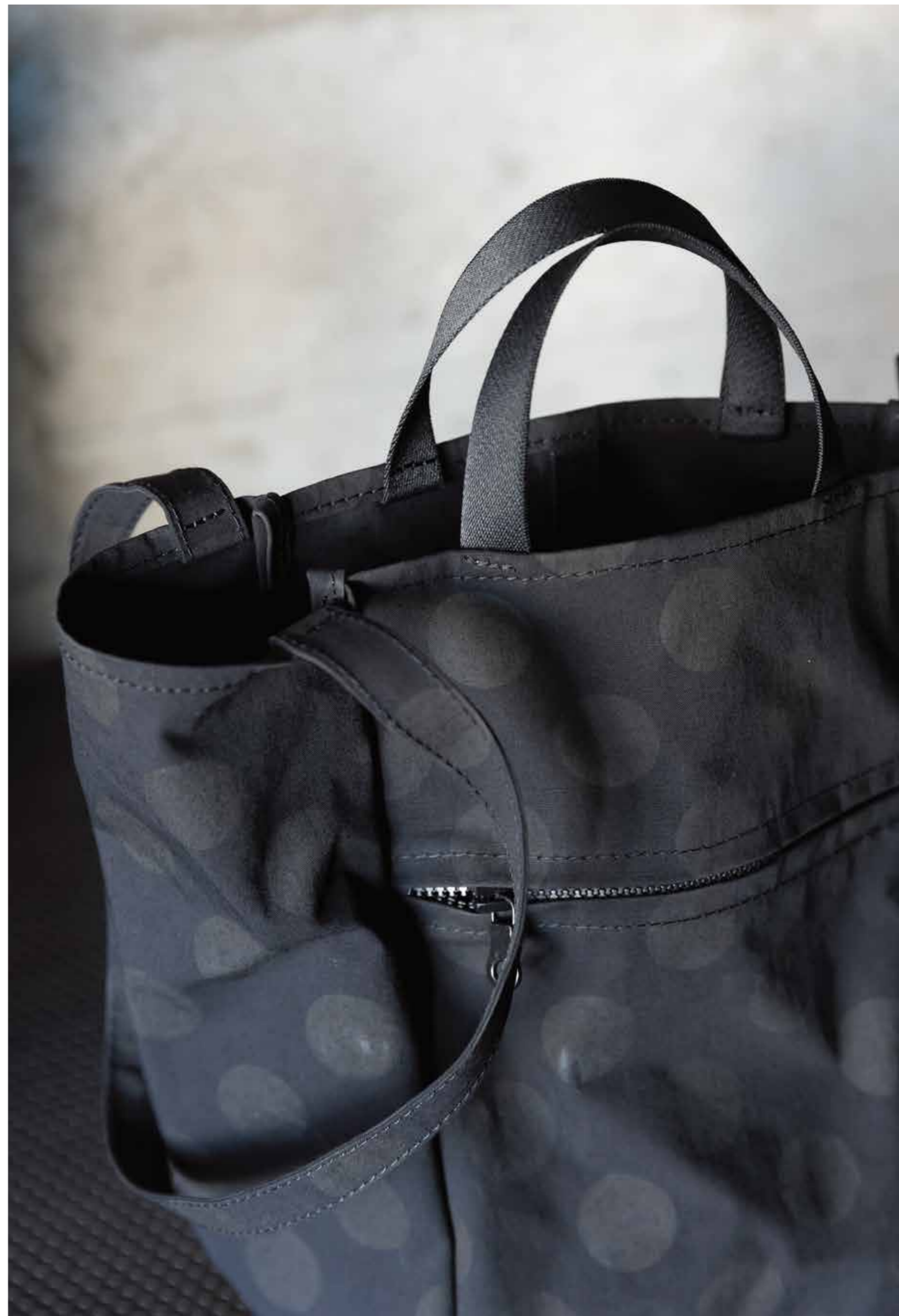
FALL/WINTER COLLECTION 2024